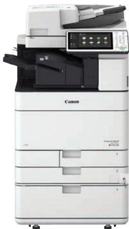
imageRUNNER ADVANCE C5500i Series Shown

With potential risks everywhere, both external and internal, organizations want tools to help protect their data. The innovative features and easy-to-use functions of the third generation imageRUNNER ADVANCE Series can help reduce the risk of information leaks and enhance overall security with multilayered security solutions to help safeguard sensitive data.*