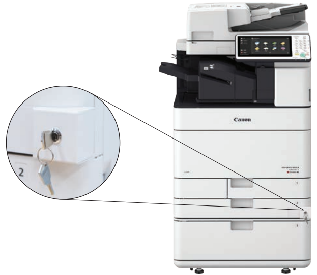
Shown: imageRUNNER ADVANCE C5500i Series

imageRUNNER ADVANCE 8500i/8500i II Series