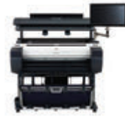
iPF785 MFP M40 ™ /iPF780 MFP M40 /iPF770 MFP M40