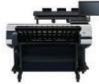
iPF850 MFP M40 ™ /iPF840 MFP M40 /iPF830 MFP M40