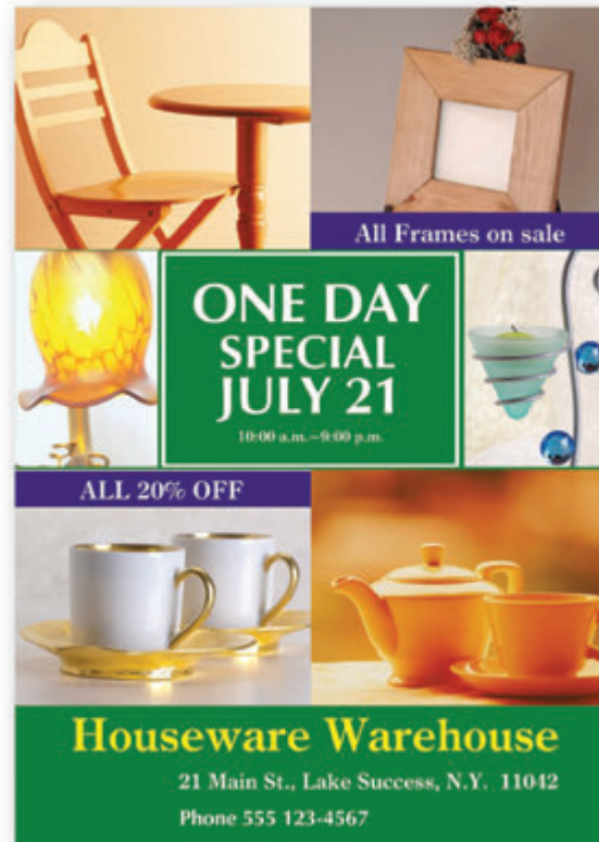
Created in PosterArtist

For those with more demanding poster creation needs, PosterArtist also includes enhanced features such as an Auto Design function, support for Variable Data Printing, and even an Ambient Light Adjustment feature that assists in compensating for perceived color changes in various lighting environments!