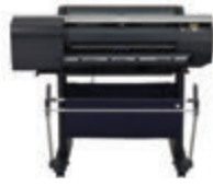
imagePROGRAF iPF6450 ** /iPF6400