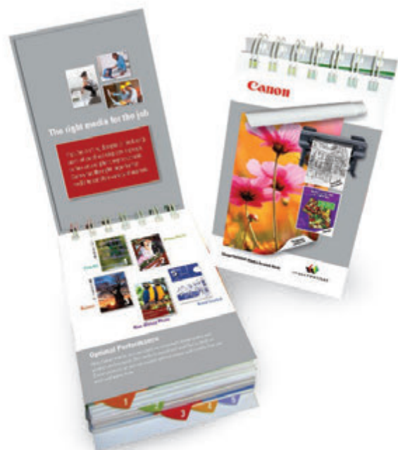
imagePROGRAF Media Swatch Book

For more information on Canon Media, please visit the Canon Consumables Web site at www.usa.canon.com/consumables/media .