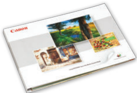
imagePROGRAF Specialty Media Swatch Book

Special artwork deserves special media. Paintings and digital art superbly reproduce on Canon Fine Art Media. Available in canvas, velvet, and water-resistant styles, Canon Media meets the challenge of fine art printing.