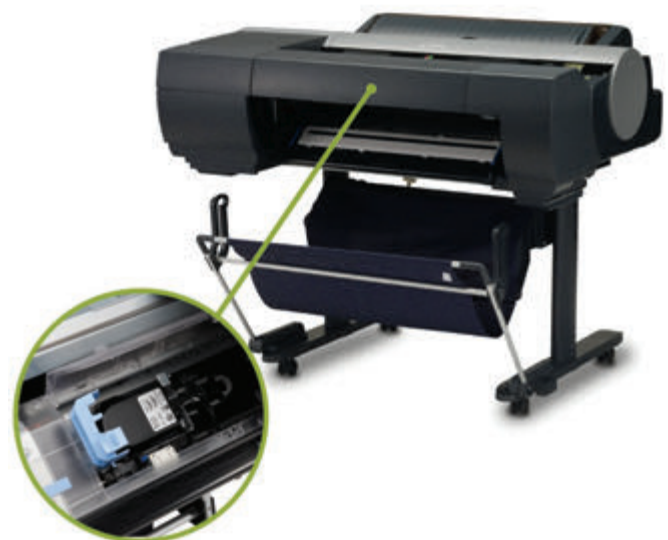
imagePROGRAF iPF6450 shown