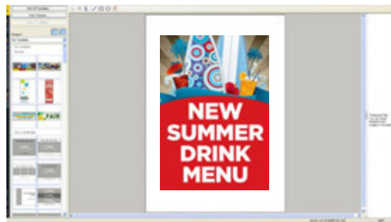
PosterArtist poster creation software

The iPF SE Series is an ideal solution for anyone looking to create eye-popping posters, banners, and infographics. With these types of users in mind, Canon has designed the iPF SE Series to be integrated seamlessly with its PosterArtist Lite software. This easy-to-use software is template-driven and includes predesigned templates, royalty-free images, and clip art. Users can create professional posters, banners, and signage in just four easy steps—for almost any application! A new image correction function for PosterArtist Lite automatically corrects image colors and enables a "cut out" function where selected areas of an image, such as backgrounds, can be removed for enhanced customization. A free version of PosterArtist Lite comes with every iPF8400SE and iPF6400SE printer, and a full version of PosterArtist is available for purchase. The full version includes some added value features such as an expanded library of templates and variable data printing.